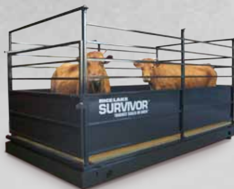
SURVIVOR LS Series pictured here with custom racks and gates.

In a market crowded with scales manufactured to compete on price alone, Rice Lake's livestock scales are built from the ground up for lasting performance under the most severe conditions. Whether you choose the RoughDeck™ SLV single animal scale or the SURVIVOR® AG, LV or LS, you're getting the Toughest Scale on Earth.™