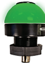
Optional IP69 Stack Light