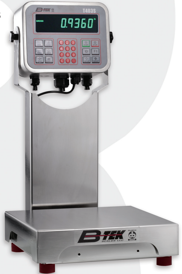
Bench Scale Complete

The AquaShield Bench Scale is specifically designed for use within weighing environments where washdown is a priority. With a ridged frame and hardware made of 304 SAE stainless steel, FDA compliant feet and Aqueduct Drainage System (ADS), the AquaShield is resistant to water and rust allowing it to be washed down as needed.