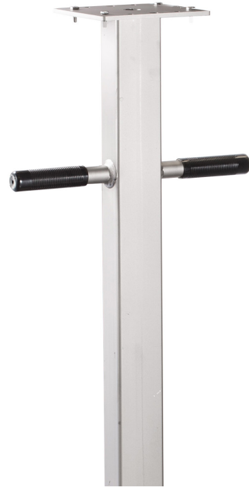
Bolt on Tube Column with Handle Grips and Top Plate